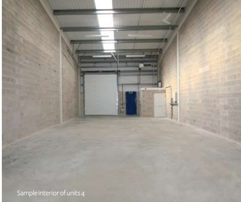
Sample interior of units 4